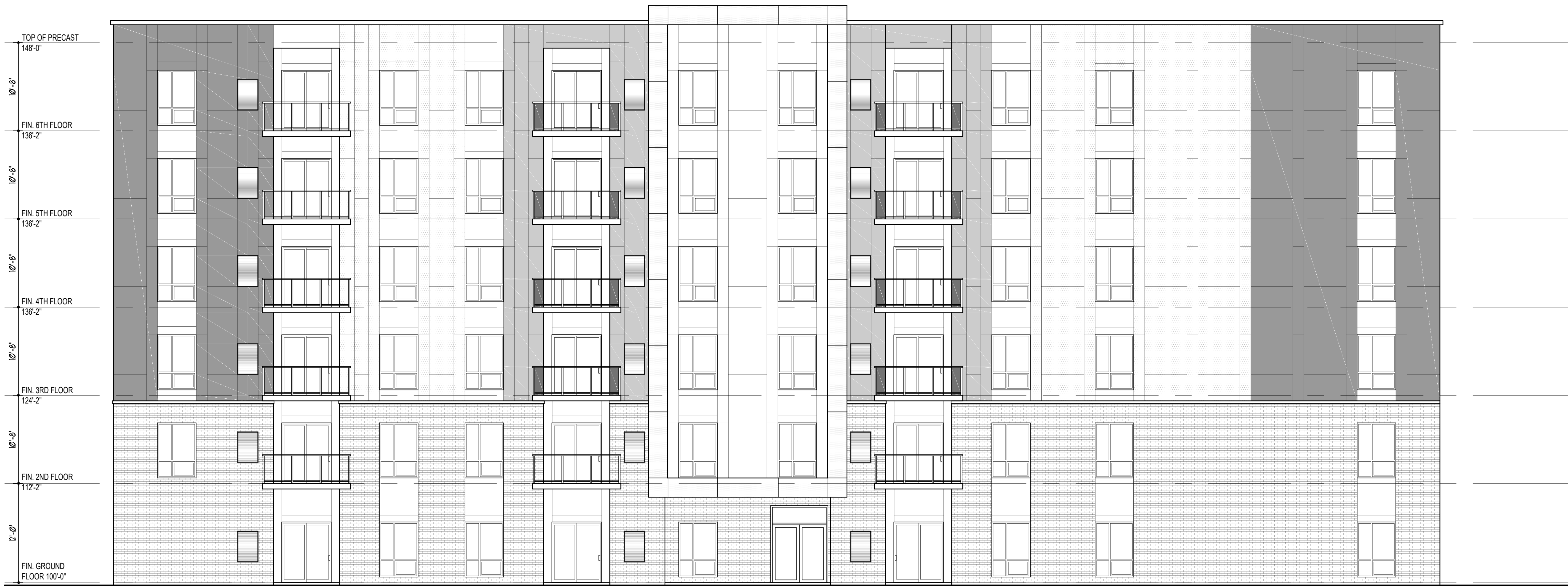
PRELIMINARY SOUTH ELEVATION SCALE: 1/8" = 1'-0"

WINDSOR T 519.254.2600 ONTARIO F 519.254.2670